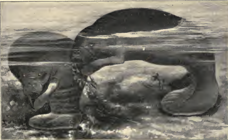
FIG. VI. TRICHECHUS MANATUS. MANATEE.